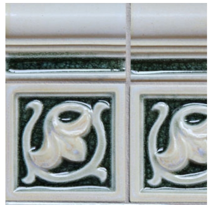
Carved pieces: Expect to see pooling in deeper areas and a lighter application on high areas.