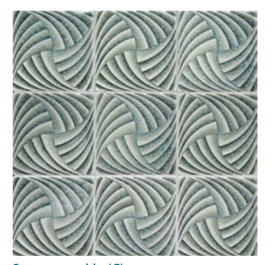
Stream crackle (C)