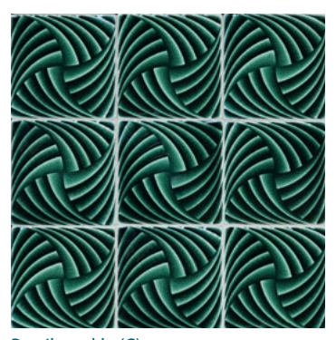
Brazil crackle (C)