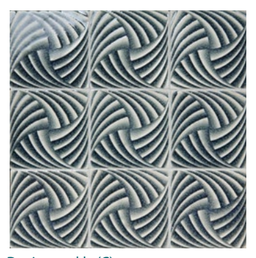
Denim crackle (C)