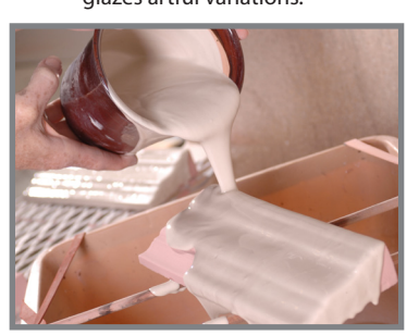
HAND APPLIED GLAZES USING SKILLED TECHNIQUES. Every tile is made to order for your installation.