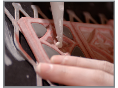
BEFORE KILN FIRING. After carefully creating and applying the glaze, we await the big reveal.